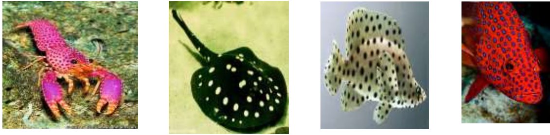
Fresh water Polka Dot