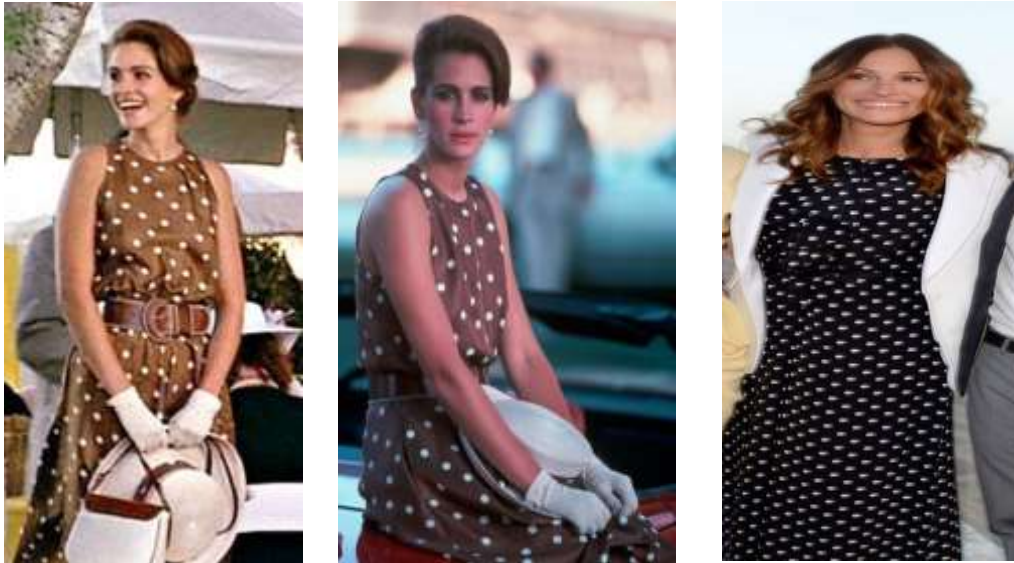
Julia Roberts fig (36)